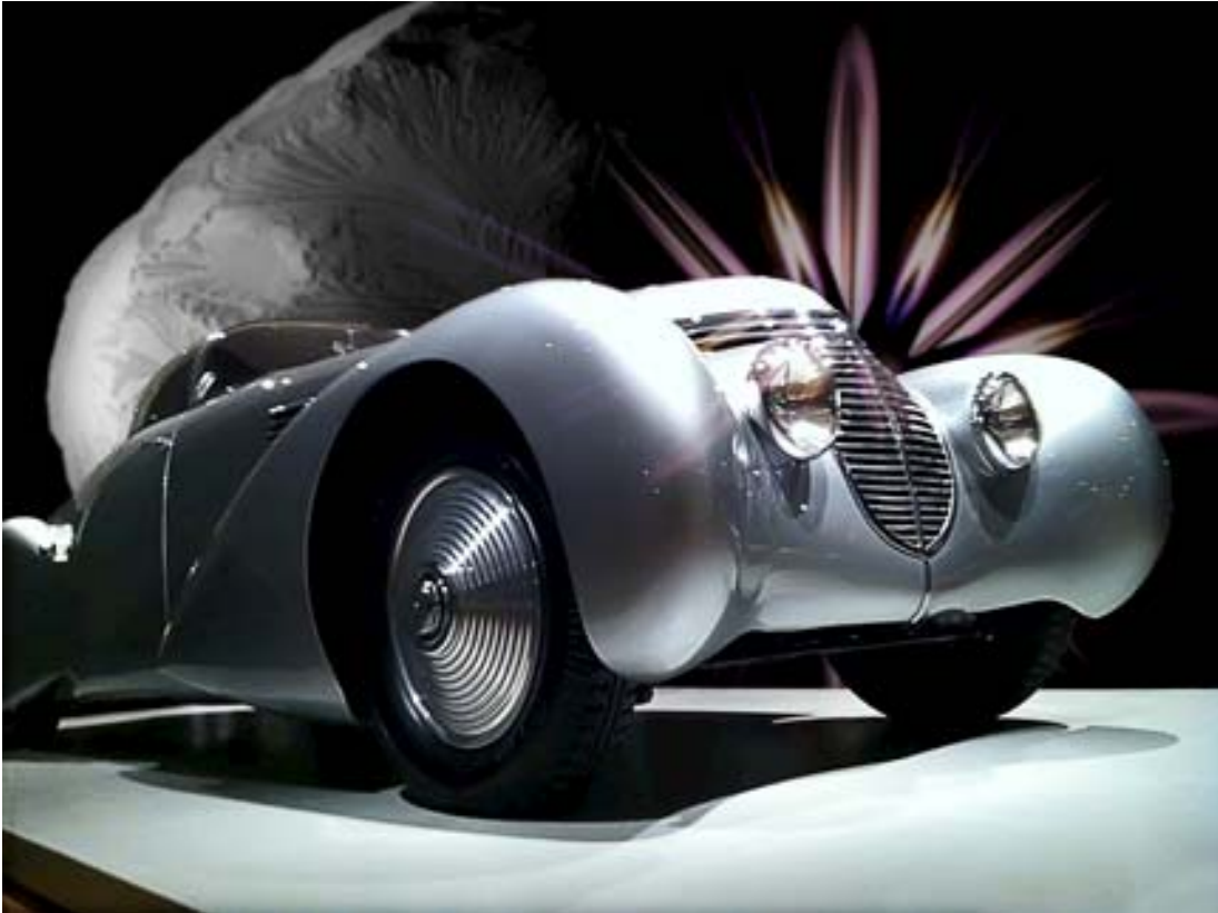
Car shot at the Portland Art Museum exhibit: Allure of the Automobile Background courtesy of NASA

Likewise, the special effects and touch-up actions can be applied to just about any image once you select the area to be adjusted. For example, you can use the Lasso tool along the right side of your subject to isolate where the rim light will be applied.